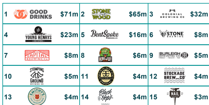
Top 15 Retail Sales Value

In the off-premise channel, we are proud to be positioned the #1 Independent Supplier by Value in the Australian Craft Beer Segment. Good Drinks creates more value for our retail customers in the craft category than any other independent supplier.